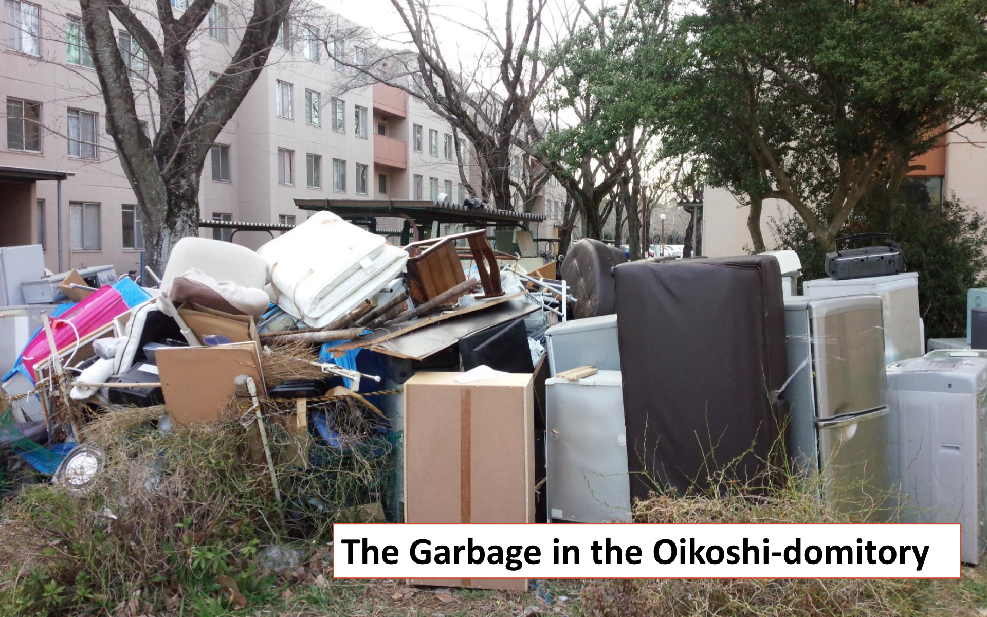
The Garbage in the Oikoshi-dormitory