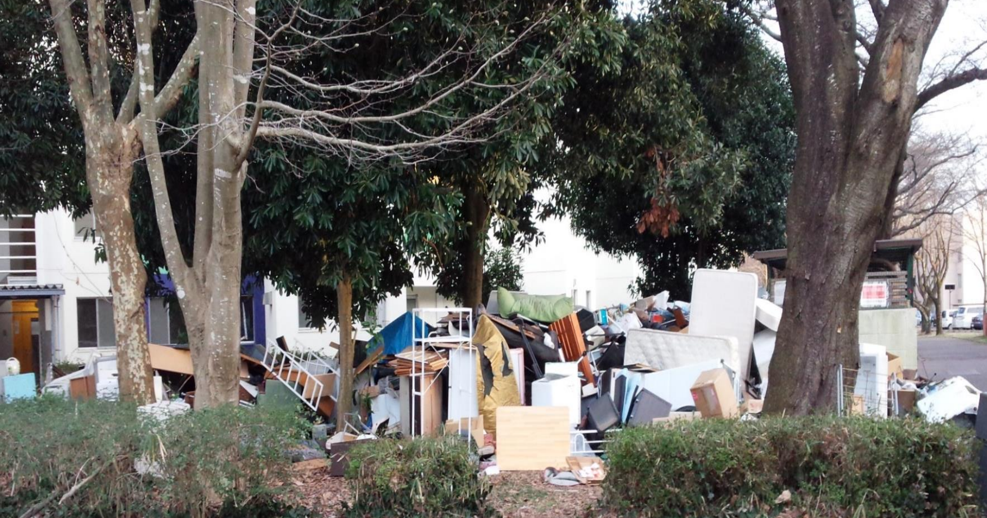
The Garbage in the Hirasuna-dormitory